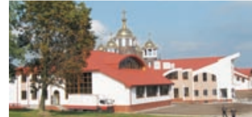
Holy Spirit Seminary, Lviv