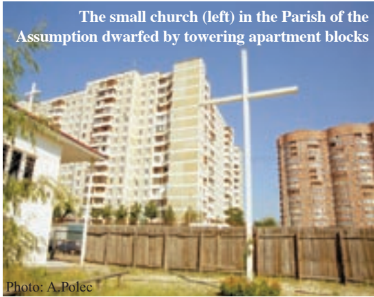
The small church (left) in the Parish of the Assumption dwarfed by towering apartment blocks

On your behalf we have promised more than $78,000 to help restore the light of Christ to this city, so long darkened by the oppressive shadow of communism.