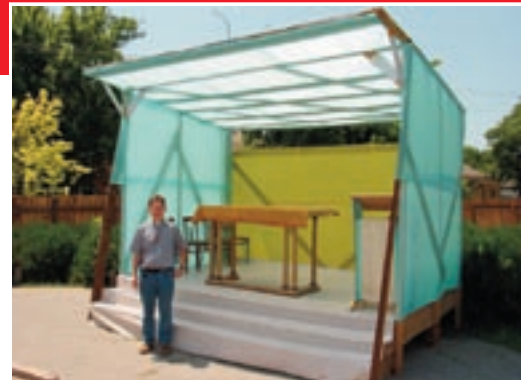
Kherson's faithful worship at this outdoor altar. Can you help them to build a new church?

Many of his faithful are from families who were