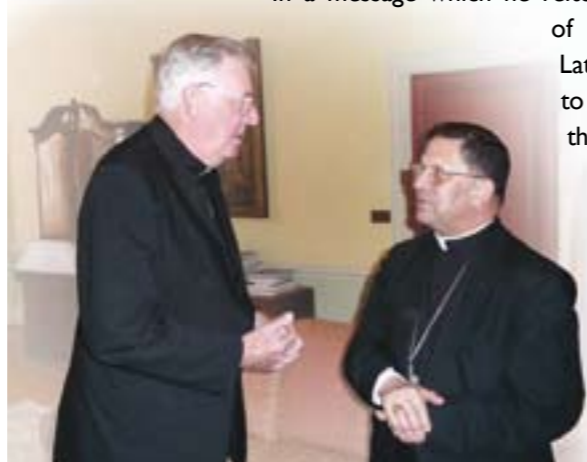
Cardinal Murphy-O'Connor meets Archbishop Sleiman

Highlighting the need for catechetical centres, formation for the young and humanitarian help, he added: “Helping Christians to remain in or to return to their homeland is what really matters - this is how Iraq can truly be rebuilt.”