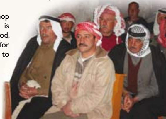
Many Christians like these have fled their homes

The aid also reminds them that in spite of persecution, bereavement and displacement, they are not forgotten.