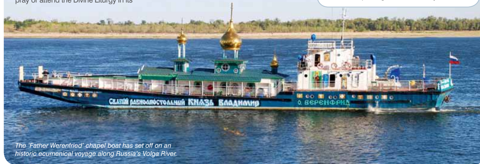
The ‘Father Werenfried’ chapel boat has set off on an historic ecumenical voyage along Russia’s Volga River.

Thank you for helping priests reach out to their scattered flocks through initiatives such as the chapel boats. Through your ongoing support ACN can continue to provide mopeds, cars and even outboard motors for boats to help bring Christ to thirsty souls.