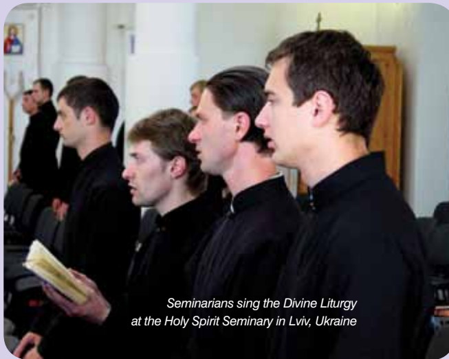
Seminarians sing the Divine Liturgy at the Holy Spirit Seminary in Lviv, Ukraine