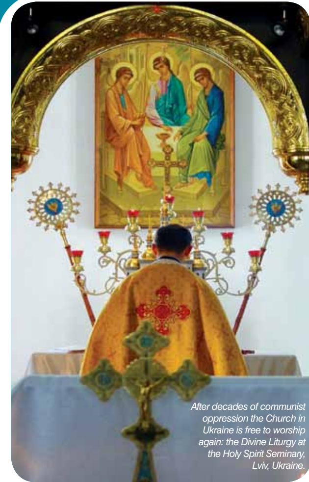
After decades of communist oppression the Church in Ukraine is free to worship again: the Divine Liturgy at the Holy Spirit Seminary, Lviv, Ukraine.

Building a foundation for reconciliation between Orthodox and Catholics is central to ACN's work after the fall of communism. Shortly before his election as the Ukrainian Greek Catholic Church's Major Archbishop in March 2011, the Most Reverend Sviatoslav Shevchuk met with Catholic and Orthodox leaders at an ACN conference in Germany. The two Churches declared that they needed to work together to defend the Christian values that they both hold sacred. But this important ecumenical work would not be possible without the support of ACN's benefactors.